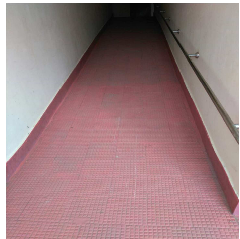
District Hospital Champhai District