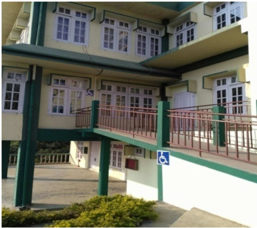
Chief Judicial Magistrate Office, Kolasib District.