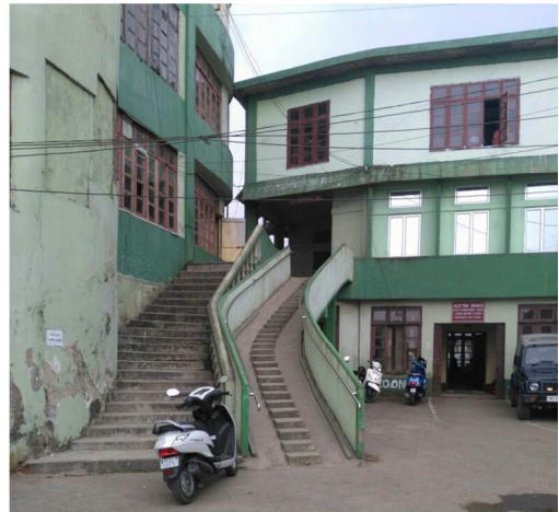
District Collector Office, Lunglei District