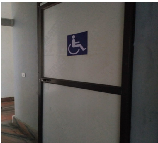
Civil Secretariat Office, Aizawl

Access Auditors were appointed vide Gazette Notification No.B.13016/5/2000-SWD dt 19.03.2004 to audit Barrier Free Built Environment in public buildings under section 46 of the Persons with Disabilities Act, 1995 within Mizoram. Having learnt that Audits had not been conducted since 2004, these Access Auditors were requested to immediately conduct Audit for Barrier Free Built Environment in Public Buildings. Hence, Audit in respect of constructions of ramps, railings and adapted toilets as sanctioned by the Ministry of Social Justice & Empowerment under SIPDA were conducted w.e.f 2013 till date.