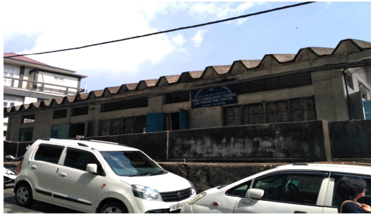
Female Training Centre, Aizawl