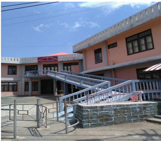
District Collector, Champhai District